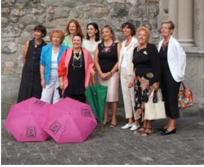
The District Board 2006-2008 in Luzern